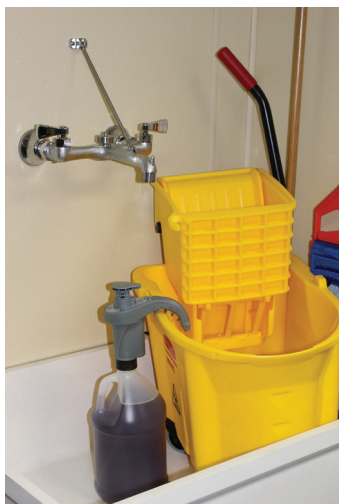
Mop bucket dosing